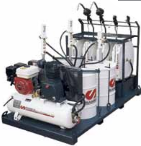
A wide variety of lube skids, designs and equipment packages are available.