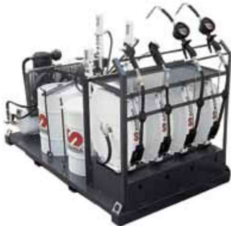
Depending on your application, lube trailers can be a flexible solution.