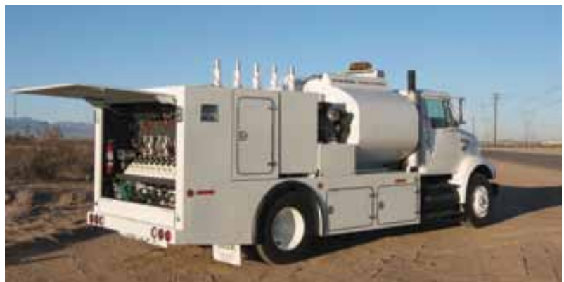
Lube trucks of all shapes, sizes and capabilities.